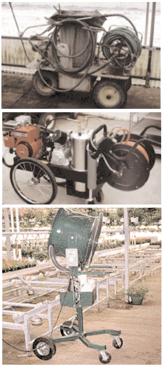
Top: Grower-assembled hydraulic sprayer on 3-wheel cart. Middle: Electrostatic sprayer with gas-powered compressor, 5-gallon tank and hose reel. Bottom: Mechanical foggers, or cold foggers, use a high-pressure pump (1,000-3,000 psi) and atomizing nozzles to produce fog-size particles.

Electrostatic sprayer. Compressed air, given a negative electric charge as it travels through the nozzle, forms spray droplets and carries them to the plants. This helps to create more uniformly sized particles that disperse well because they repel each other. Charged particles are attracted to leaves, metal and some plastics; when they strike a surface, these particles create a momentary overcharge that repels other particles. These other particles land elsewhere on the leaf, so there is more uniform coverage. The simplest electrostatic sprayer is backpack-carried and contains a tank and spray gun. It requires an independent air supply to charge the tank. Other units are cart-mounted with an integral compressor powered by a gas engine or electric motor. Electrostatic sprayers work best if the spray distance is less than 15 feet.